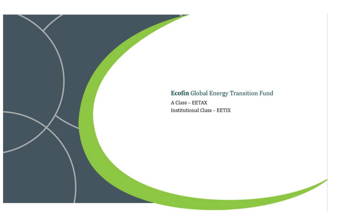
The U.S. Securities and Exchange Commission ("SEC") has not approved or disapproved of these securities or determined if this Prospectus is truthful or complete. Any representation to the contrary is a criminal offense.